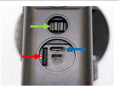
Green arrow - Focus Ring Blue arrow - Charge Port Red arrow - SD Card